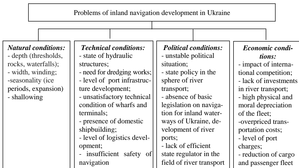
Fig. 2. Overall structure of the problems of inland navigation development in Ukraine

Conclusions. Ukraine has a large and unrealized potential for inland waterway transport. The most promising regions for the development of river navigation are traditionally two largest rivers – the Dnipro river and the Danube river. Infrastructure development and river fleet renewal, adoption of a number of legislative initiatives, aimed at simplifying the work of river carriers, can become an additional factor of activating economic activity in Ukraine. Taking into consideration prospects of river communication in the western direction, the implementation of infrastructure projects concerning the partnership of Ukraine and the EU member states is relevant.