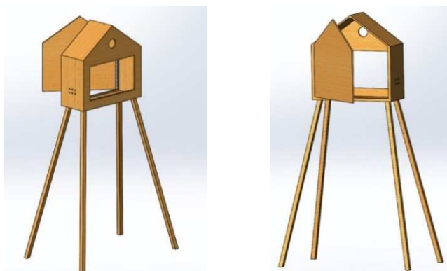
Fig. 6. Design of the case of the photo booth: front and back view

Our solution - software. The Python programming language was used to create a control program for our photo booth. It is a universal programming language that is used to create modern applications related to data analysis, media processing and other operations. This programming language works on various platforms such as Windows, Linux, Mac or even Raspbian. In our specific case, we used Python version 3.7.3 [8; 9; 10]. The resulting program has the task of providing communication between RPi, camera, monitor, mouse, keyboard, or printer, respectively implement photo sending to mail/internet storage. An important function is also communication with the user of the photo booth via the created GUI.