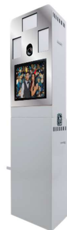
Fig. 3. Topfotobúdka FT1 [4]