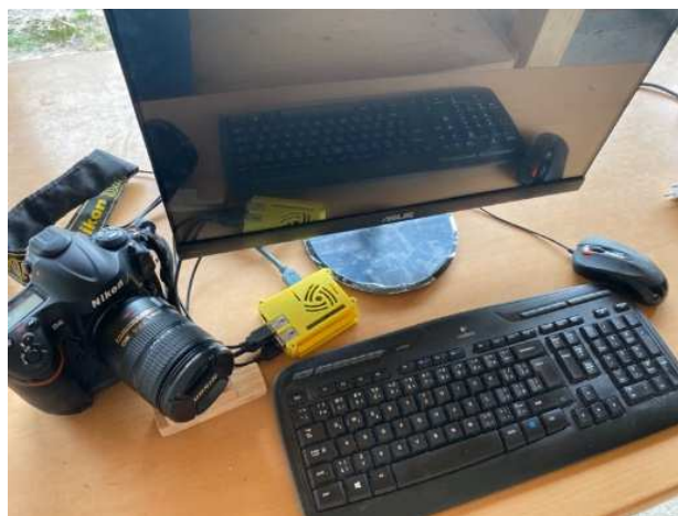
Fig. 5. The final set of the photo booth

The final set of the photo booth. In Fig. 5, we can see all the hardware components connected. The total cost of new components for the photo booth we have built (without the cabin) would be about 750 Euros. The estimated price of the photo booth cabin made of wood would be approximately 250 Euros. Its design is displayed in Fig. 6 – its dimensions are 60x60x23cm, estimated weight is about 13 kg.