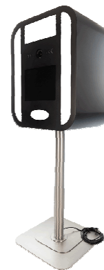
Fig. 2. FB-003 Classic [3]

The Raspberry Pi is a single-board low-cost microcomputer with a size 85×56 mm and approximately 20 mm thick, almost like a credit card. This small computer is an exposed motherboard on which hardware components are mounted, and its performance can be compared to a weaker desktop computer. It was designed primarily for teaching programming. Any operating system compatible with the ARM platform can be installed on it, but it must be taken into account that the RPi does not contain any hard disk or SSD disk. By connecting various external components, we can modify it for a specific environment and purpose [5].