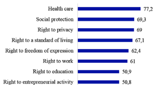
Figure 4 – Main resistance of the majority of the population to restrictions of freedoms in Ukraine in 2020, %

58.9% of respondents believe that such measures are justified. It shows that, in general, restrictions on freedoms are necessary, and the population supports such measures. But at the same time, some actions of the authorities were not understood by the citizens; for example, it concerns restrictions to visit parks, use public transport, and stay in the street without documents. Let us consider the primary resistance of the population to the actions of the authorities to prevent the spread of COVID-19 (Figure 4).