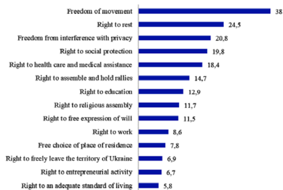
Figure 2 – Opinion of the population of Ukraine about the negative impact of COVID-19 on the established standard of living in 2020, %